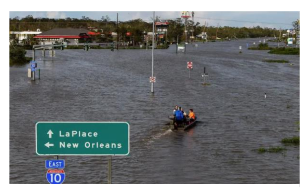
Laplace – I-10/Hwy 51 Interchange