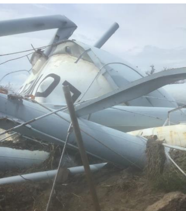
Houma Area WS – Lower Terrebonne (Dulac) Elev Tower collapse