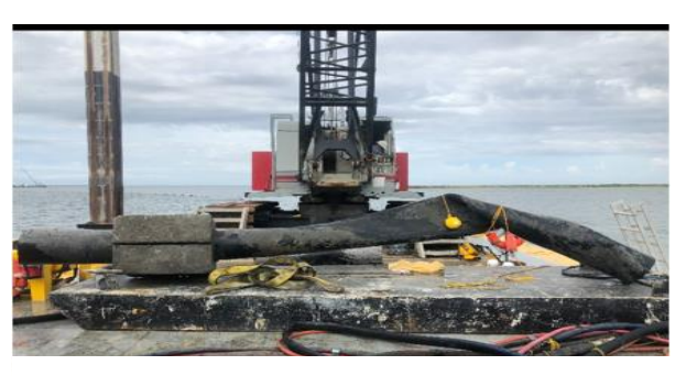
Grand Isle – Transmission pipe wrapped around oil production pipeline