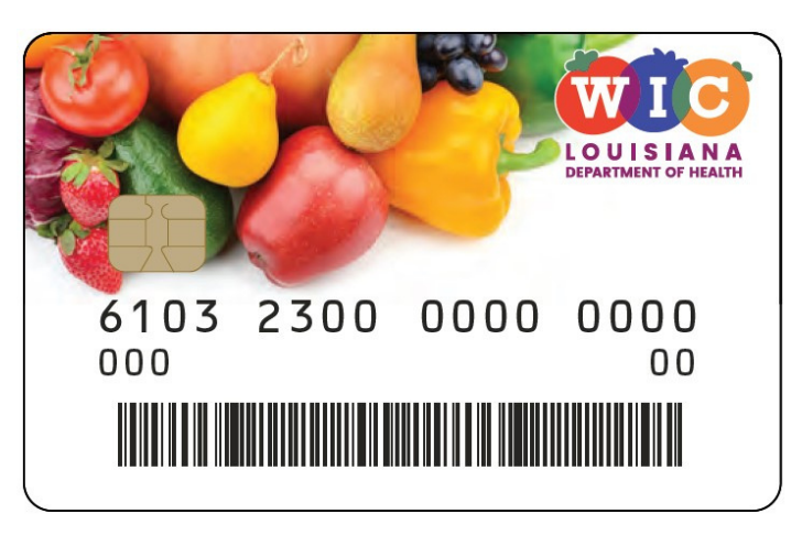
New EBT Card design released this fall