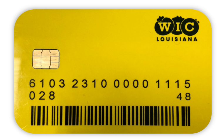
Current EBT Card design

Later this fall, WIC clinics around the state will begin to distribute to Participants a newly designed WIC EBT card that features colorful fruits and vegetables on a white background. The gold EBT cards currently in use will be phased out over time, but both card designs will be acceptable for WIC Transactions. Please inform your staff that they may begin to notice the new cards in use soon.